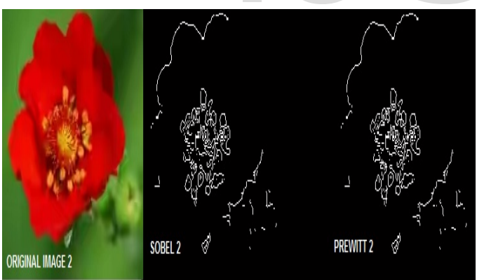
Fig 3. Example 2 of Sobel And Prewitt Edge Detection Techniques